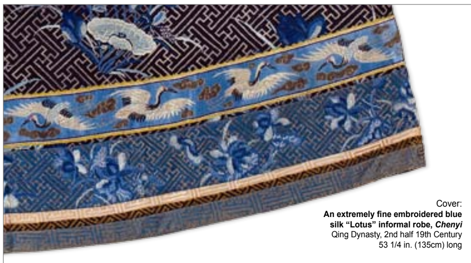
Cover: An extremely fine embroidered blue silk "Lotus" informal robe, Chenyi Qing Dynasty, 2nd half 19th Century 53 1/4 in. (135cm) long

"Do not go where the path may lead; go instead where there is no path and leave a trail."