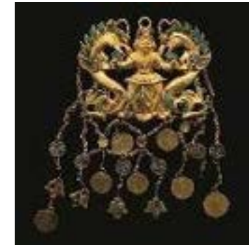
"King and Dragons" pendants Tillya Tepe, Tomb 2 AD 25-50